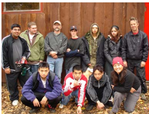
The Team Program By: Faisal Malik

Take Our Kids to Work: On Wednesday November 1 st Grade 9 students participated in Take Our Kids to Work Day. This was an excellent opportunity for students to make connections between what they are learning at school and the workplace. This experience allowed students to explore the many occupational choices available to them after high school.